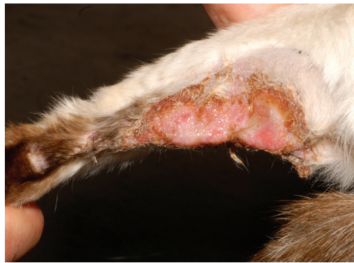
Fig. 3: Eosinophilic plaque.