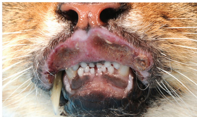
Fig.1: Indolent ulcer.