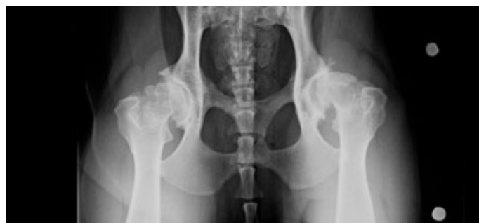
An x-ray showing bilateral hip osteoarthritis

Non-surgical treatment of hip dysplasia is targeted at limiting impact on the unstable painful joint in the young dog and managing the associated osteoarthritis in the older dog. Please see owner information regarding osteoarthritis for details.