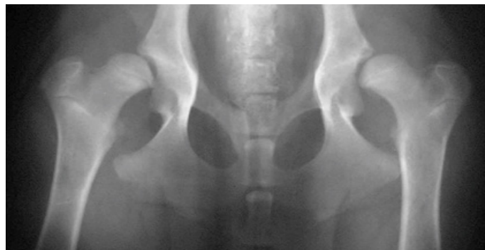
An x-ray showing bilateral hip dysplasia in a young dog

pelvis and hind limbs. Excessive hip laxity or a reduced range of hip motion may be present in young and adult animals respectively. X-rays of the hips are used to demonstrate the degree to which the hip formation is abnormal, and the presence and severity of secondary osteoarthritis. The severity of signs of hip dysplasia on x-rays does not always correlate to the severity of clinical signs.